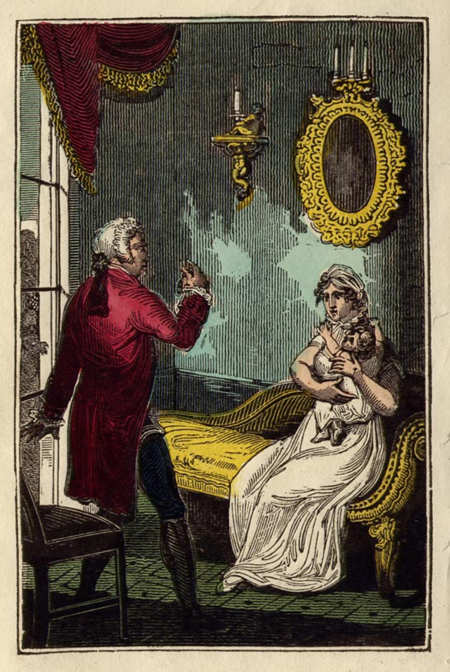
No sooner had the Earl gazed on the miniature, than his countenance underwent a serious change.