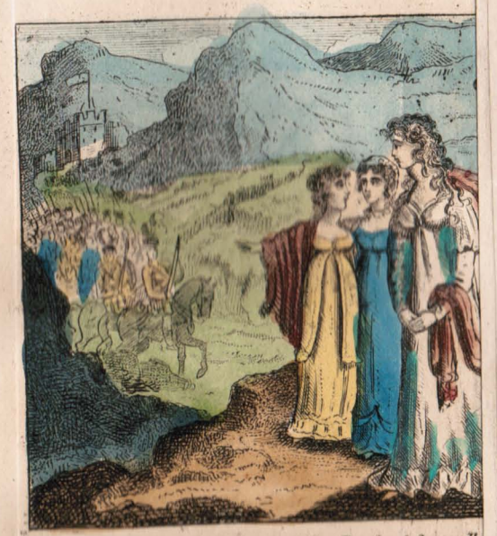
Dar-thula watching the departure of her Brother & Garmallo