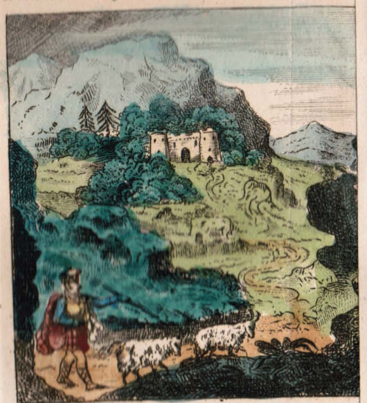
The phenxied Dar Stula appearing on the Grags to the at