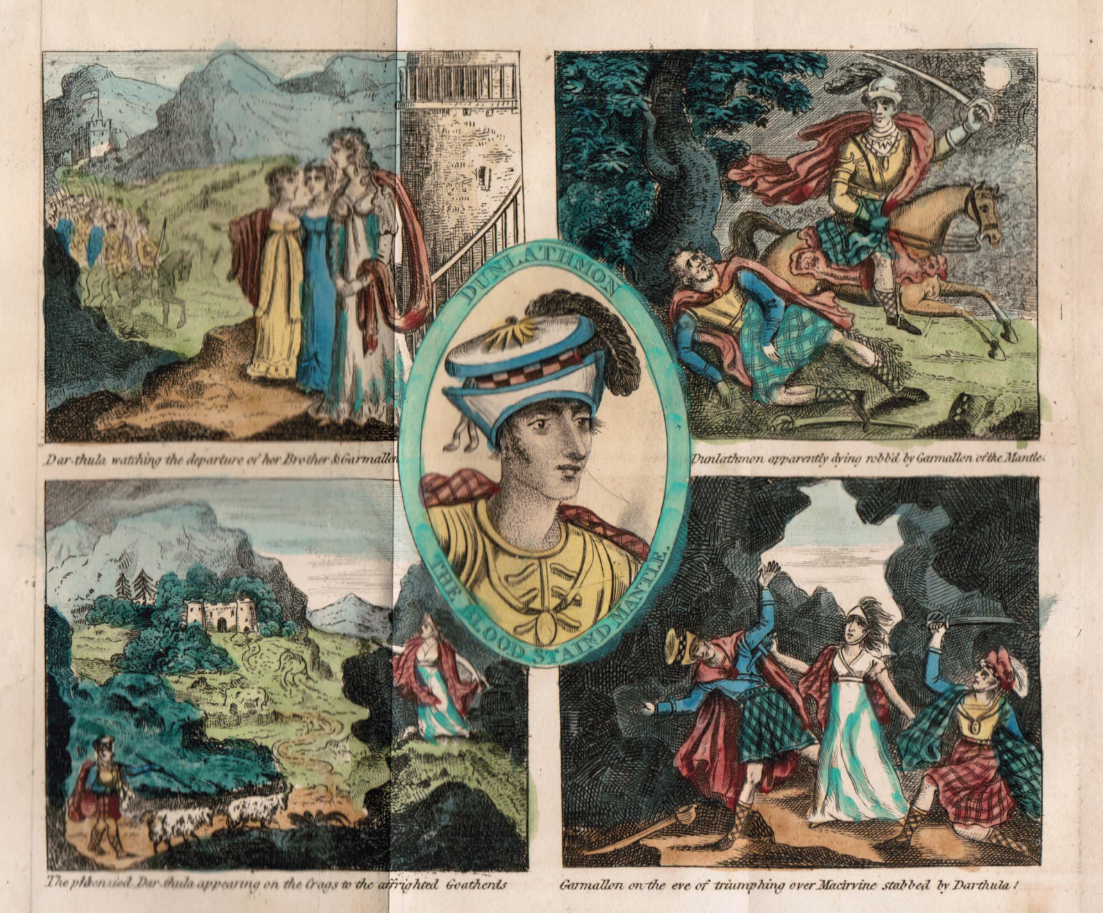
Pub. by Hodgson & C. IC Newgate S.